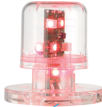
LED bulb shown in socket